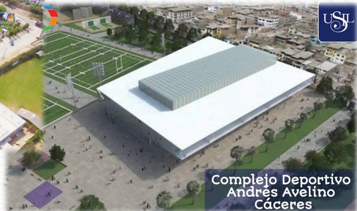
Complejo Deportivo Andrés Bello Cáceres